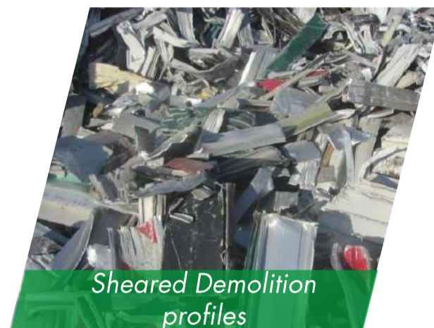
Sheared Demolition profiles