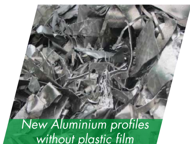
New Aluminium profiles without plastic film