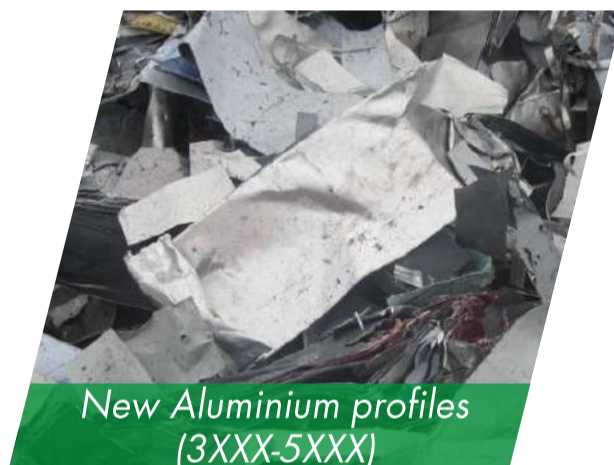
New Aluminium profiles (3XXX-5XXX)