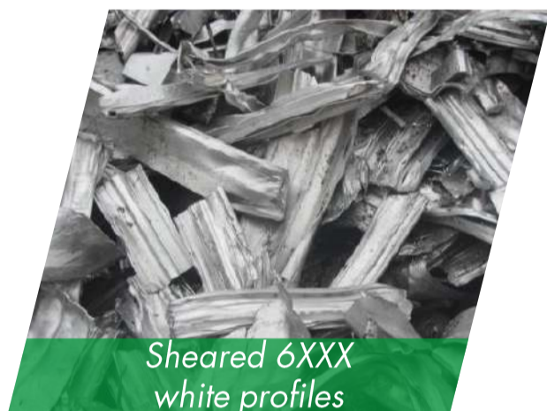
Sheared 6XXX white profiles

We offer different types of recycling raw materials, according to each customer's needs.