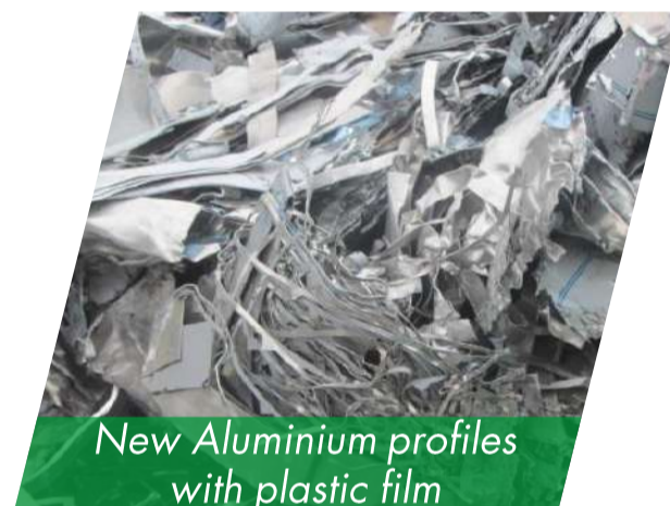
New Aluminium profiles with plastic film