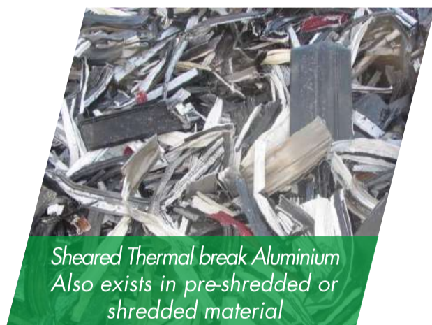
Sheared Thermal break Aluminium Also exists in pre-shredded or shredded material